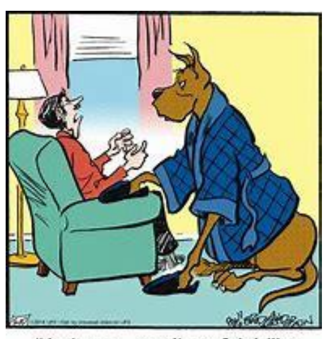
"Just once ... can't you fetch like other dogs?"